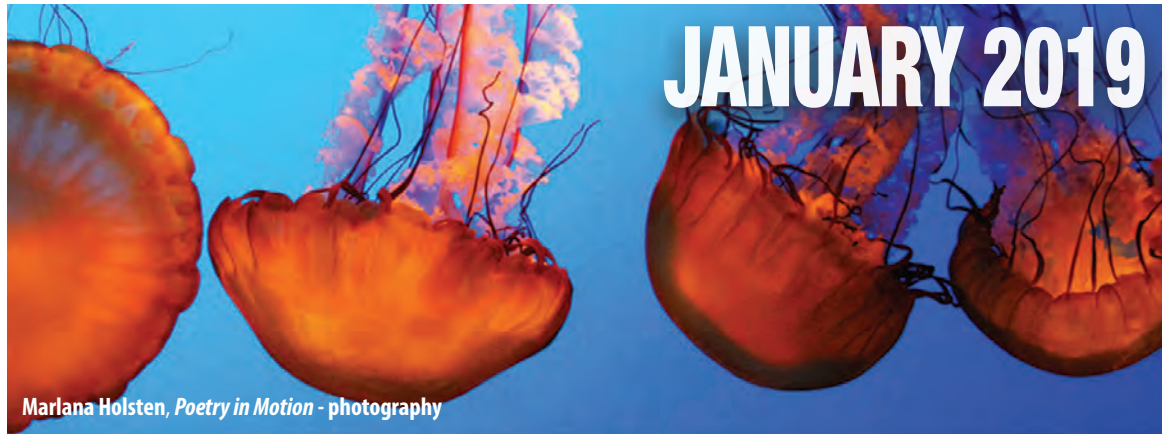
Marlana Holsten, Poetry in Motion - photography