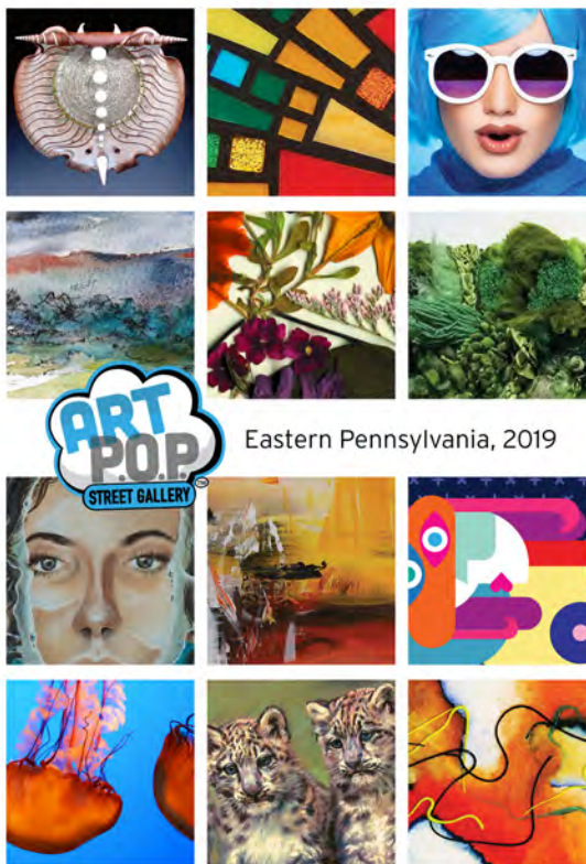
Eastern Pennsylvania, 2019

Joe Edelman , Allentown, Blue - digital photography