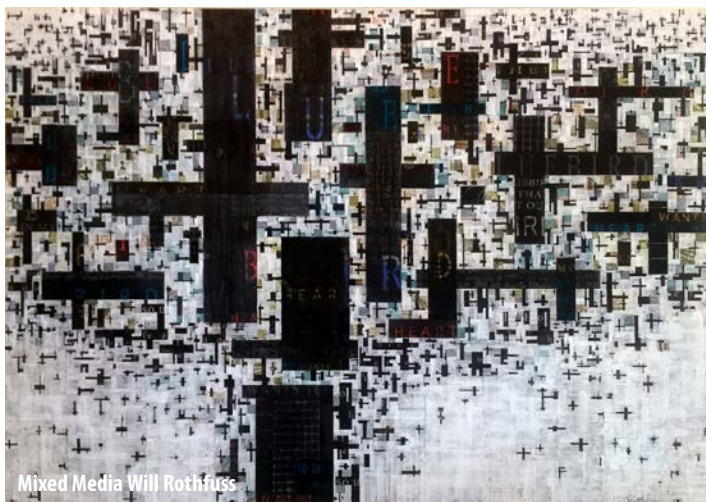
Mixed Media Will Rothfuss