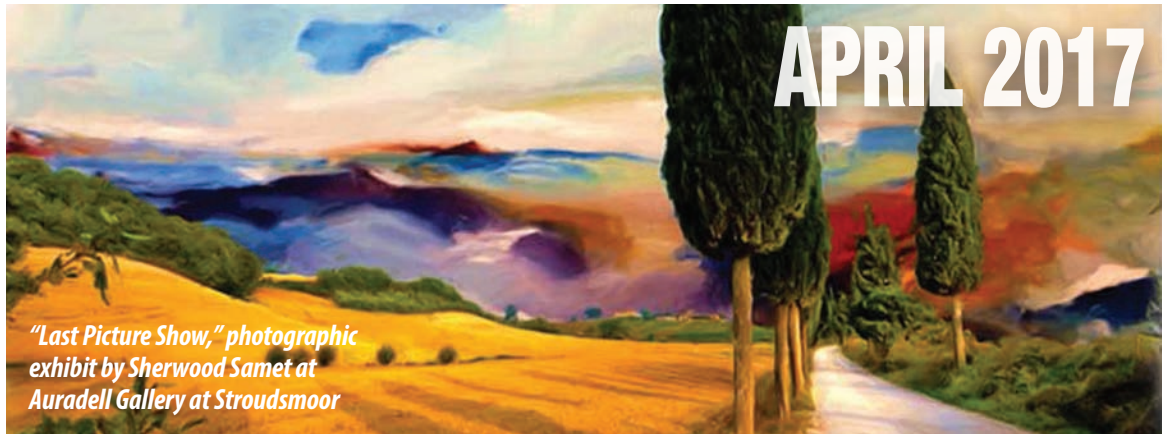
"Last Picture Show," photographic exhibit by Sherwood Samet at Auradell Gallery at Stroudsmoor