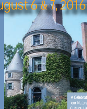
A Celebration of our Natural and Cultural Heritage of Wood

Saturday 10am-5pm, Sunday 10am-4pm Grey Towers National Historic Site, Milford PA Free Admission