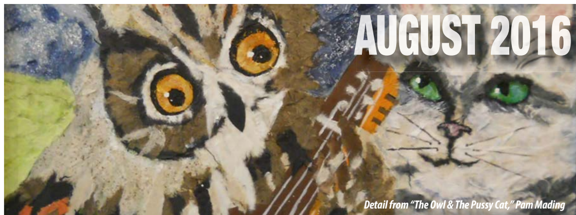
Detail from "The Owl & The Pussy Cat," Pam Mading