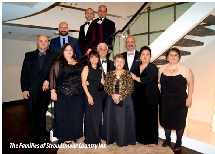
The Families of Stroudsmoor Country Inn

Tickets for the gala are a reasonable $60 per person for PoconoArts members and $70 for non-members. For further information, or to reserve your place, call the Pocono Arts Council at 570-476-4460 or visit www.poconoarts.org to reserve on line.