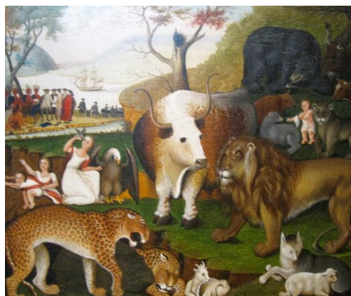
Edward Hicks, Peaceable Kingdom 1846

For more details and to register for the event, go to friendsofdewanps.org/events.html and click on the event History of Art in the Park article. Registration is not required, but recommended. You may also drop an email to info@friendsofdewanps.org to let us know you plan on attending.