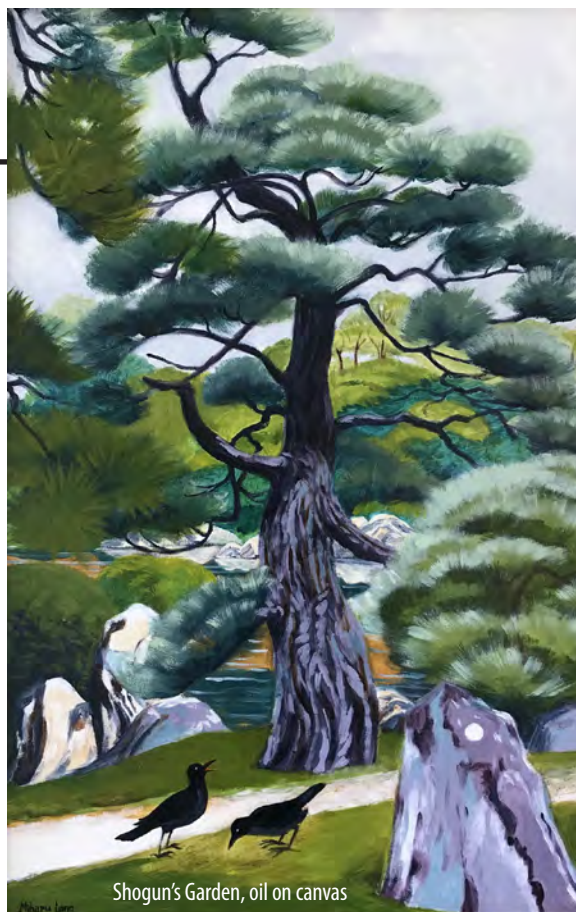
Shogun's Garden, oil on canvas