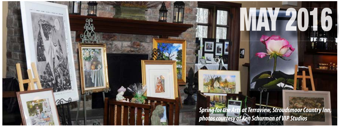
Spring for the Arts at Terraview, Stroudsmoor Country Inn, photos courtesy of Ken Schurman of VIP Studios