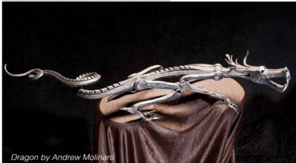
Dragon by Andrew Molinaro

Oct. 6 - Nov. 2 Madelon Powers Art Gallery Fine and Performing Arts Center East Stroudsburg University of PA Reception for the Artists Oct. 7, 4 - 6 p.m.