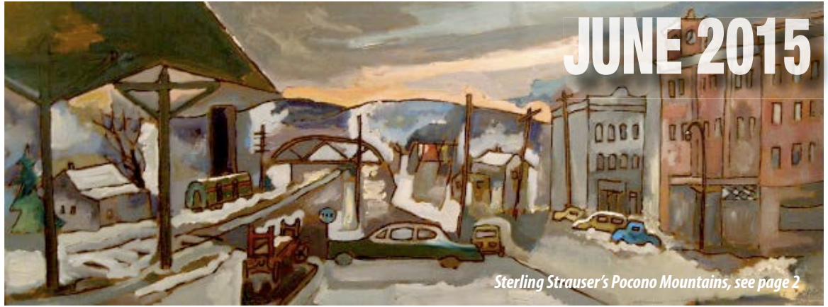
Sterling Strauser's Pocono Mountains, see page 2