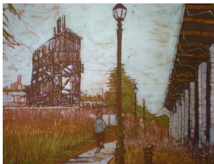
Lenore Mills (batik) –The Transfer Station will be on exhibit in the Pocono Arts Collage show this summer at Northampton Community College

The Sterling Strauser Gallery at East Stroudsburg University ESU Innovation Center ♦ 562 Independence Road, East Stroudsburg, PA 18301